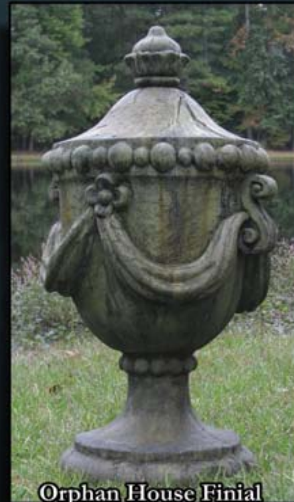
Orphan House Finial

Reproduced from Middleton Place, America's oldest landscape garden and national historic landmark, c.1741.