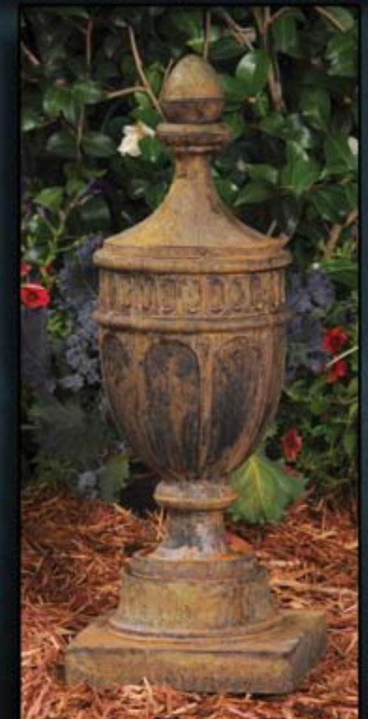
Charles Towne Finial

Reproduced from a wooden urn once adorning the Charleston Orphan House, s. 1796.