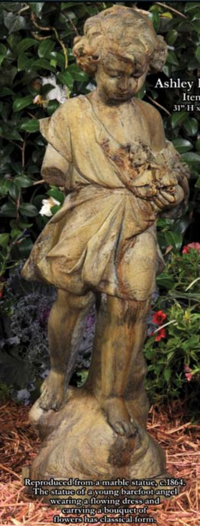
Ashley River Angel