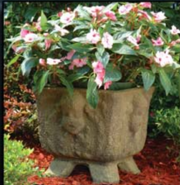
Square Charleston Cherub Planter

Sea trade routes through Asia, Europe, England and the Caribbean in the 18th and 19th centuries brought a wealth of worldly culture to this renowned city.