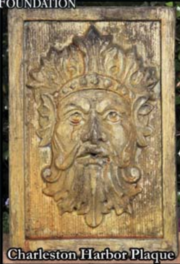
Charleston Harbor Plaque

Reproduced from a marble statue, c.1864. The statue of a young barefoot angel wearing a flowing dress and carrying a bouquet of flowers has classical form.