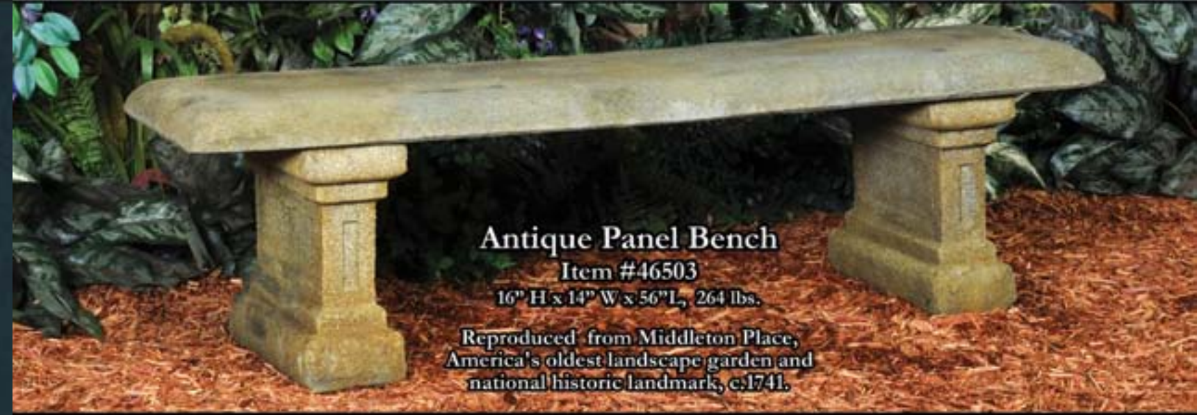
Antique Panel Bench

A beautiful adaptation allowing the collector to bring grace and beauty to their garden.