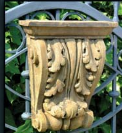
Large Acanthus Corbel

Inspired by war, fire, cyclones and earthquakes that fell upon the holy city during the last quarter of the 19th century.